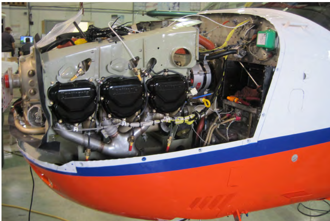
Wipaire's IO-550 STC Engine Install