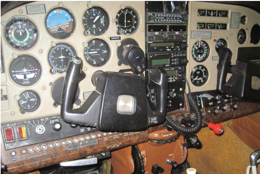
Original Avionics Suite