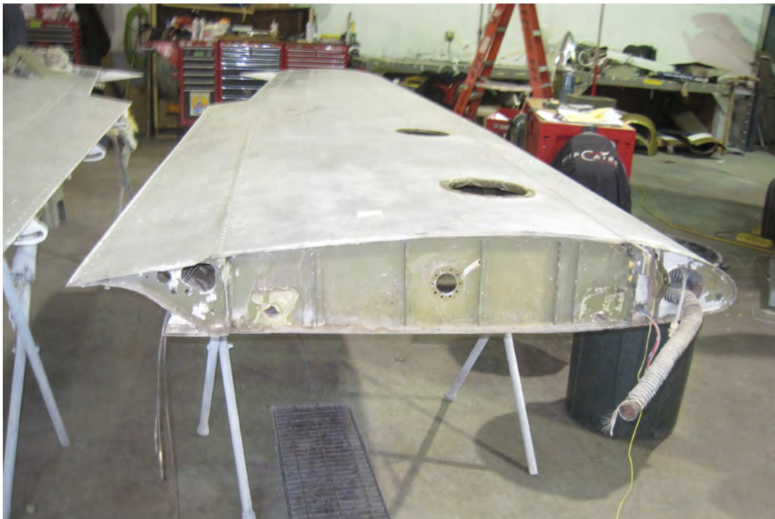
New Fuel Bladders Installed