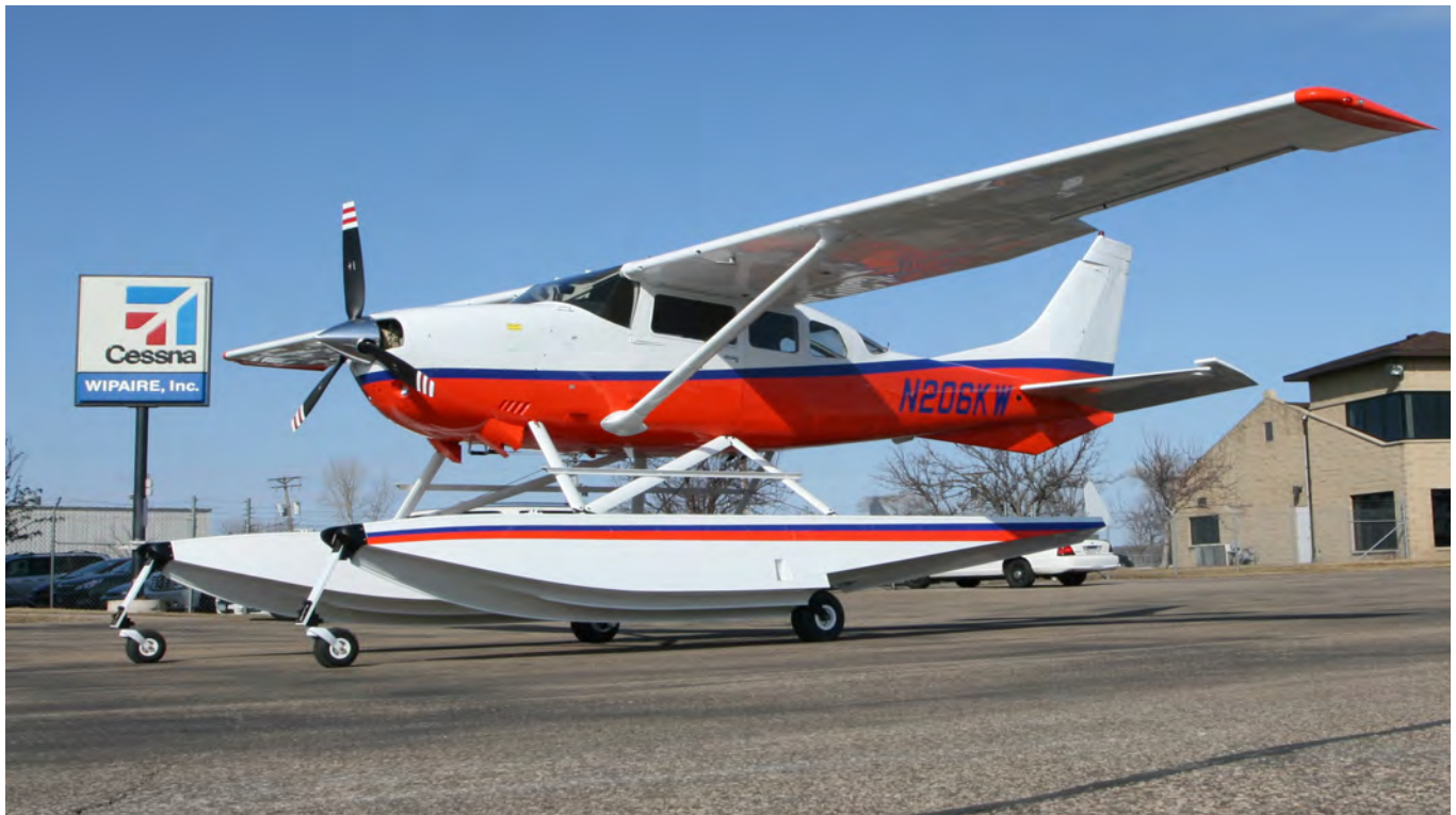
The Completed Rebuild