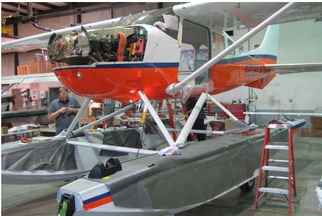
New Wipline 3450 Amphibs Installed