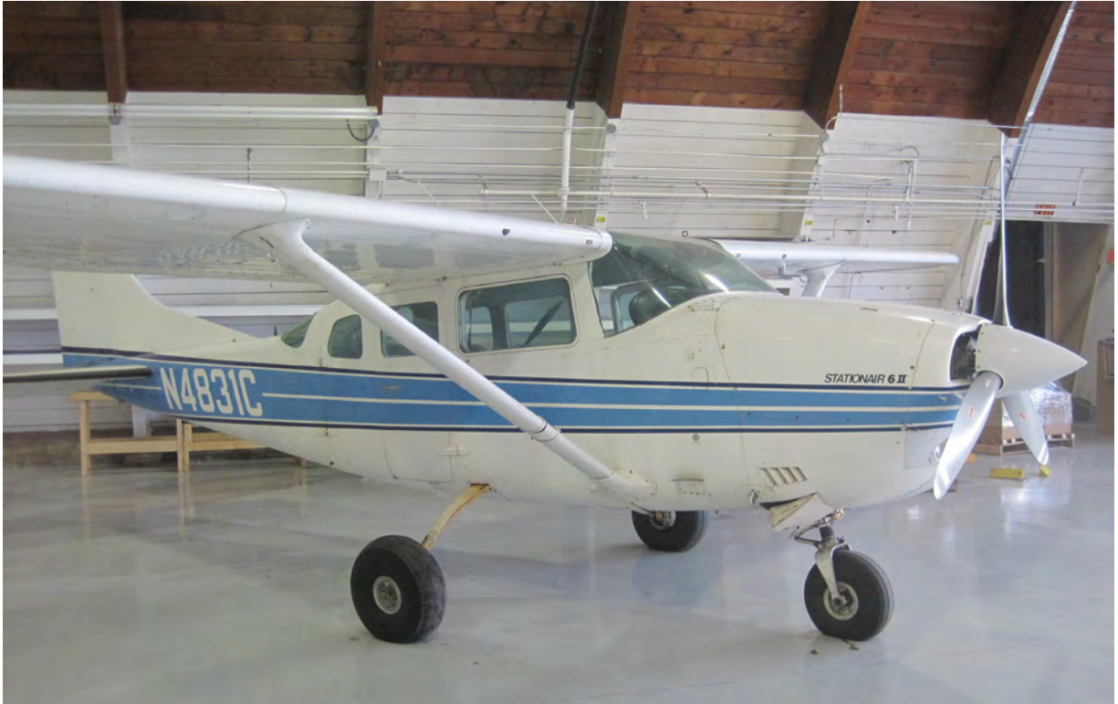
1977 Cessna U206G