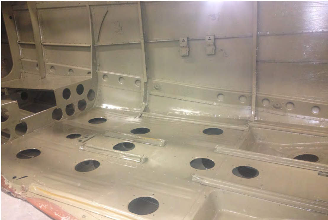
Epoxy Primer Paint Preparation