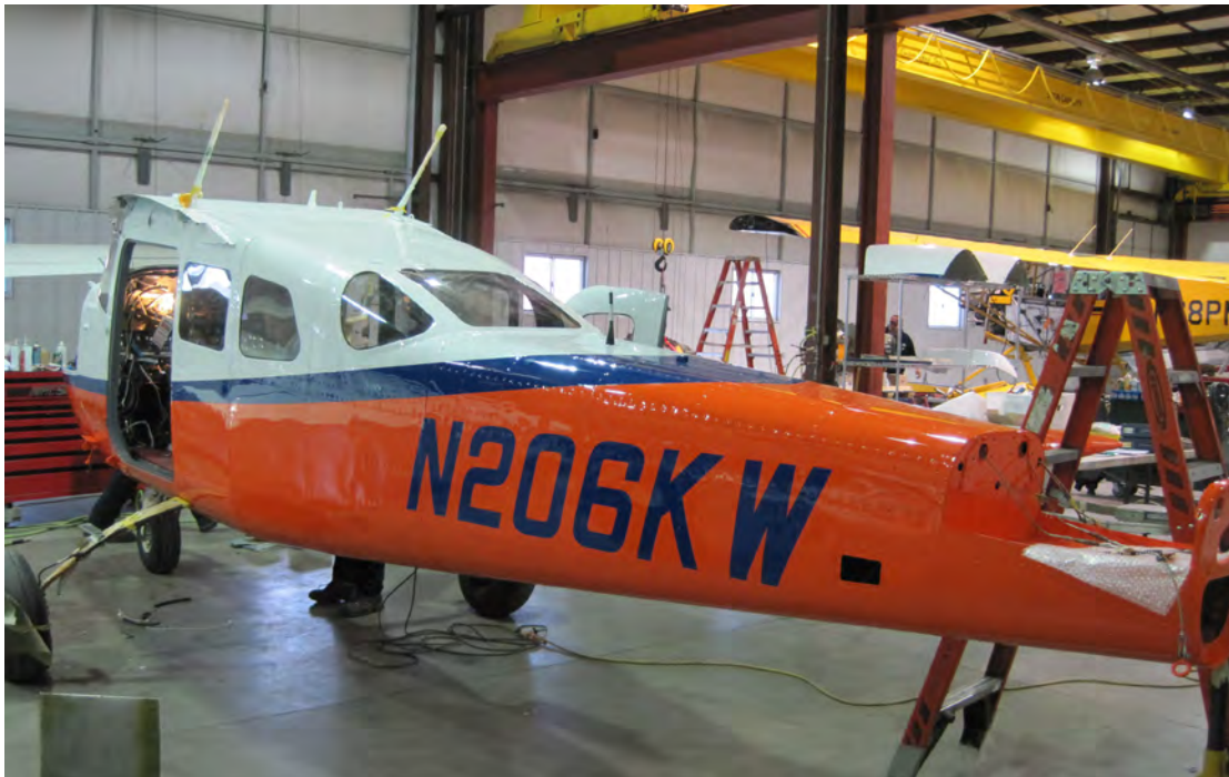
New Glass Installed