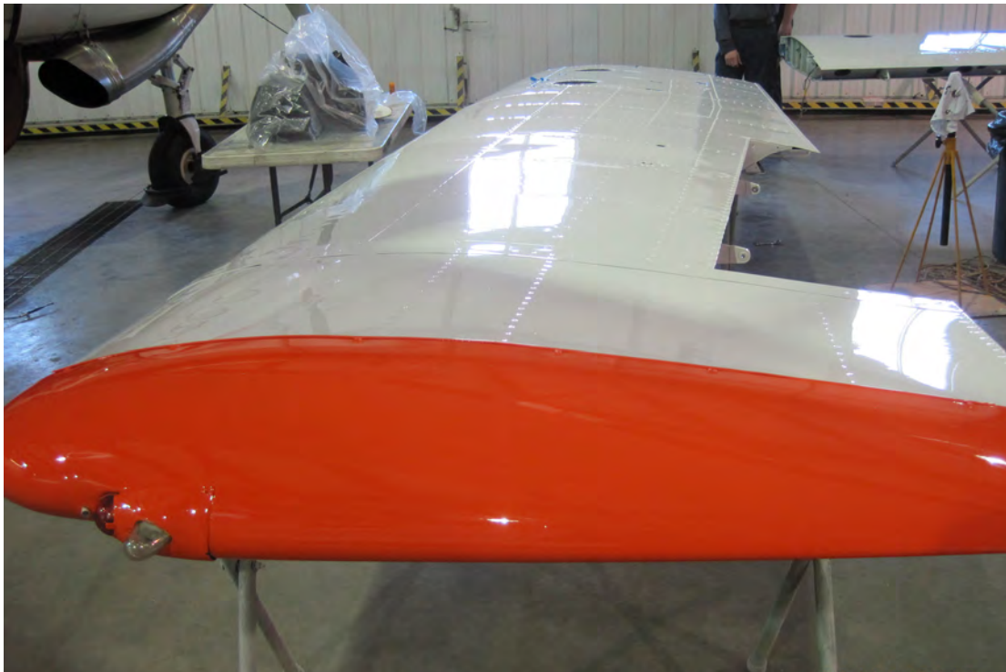
"Wip" Tip Wing Extensions Installed