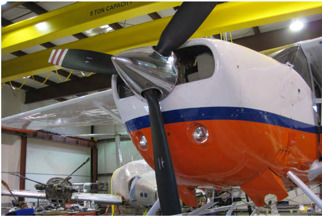
-550 Engine Paired With a 3-Blade McCauley Propeller