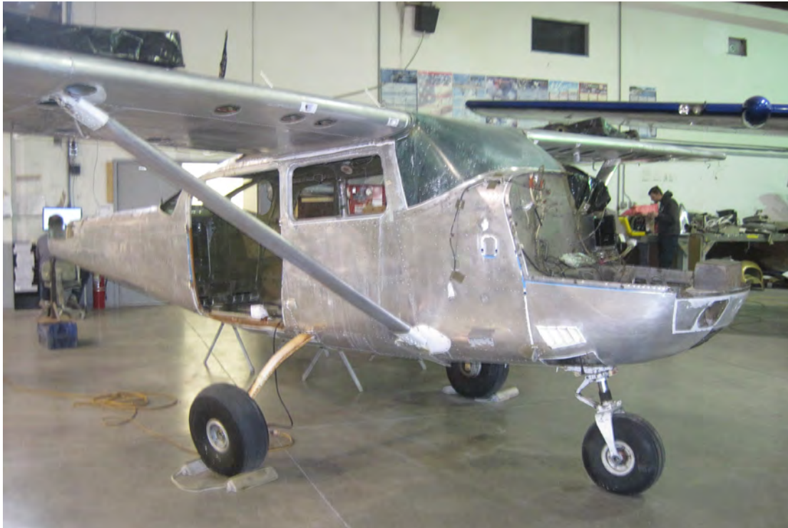
IO-520 Engine and Propeller Removal