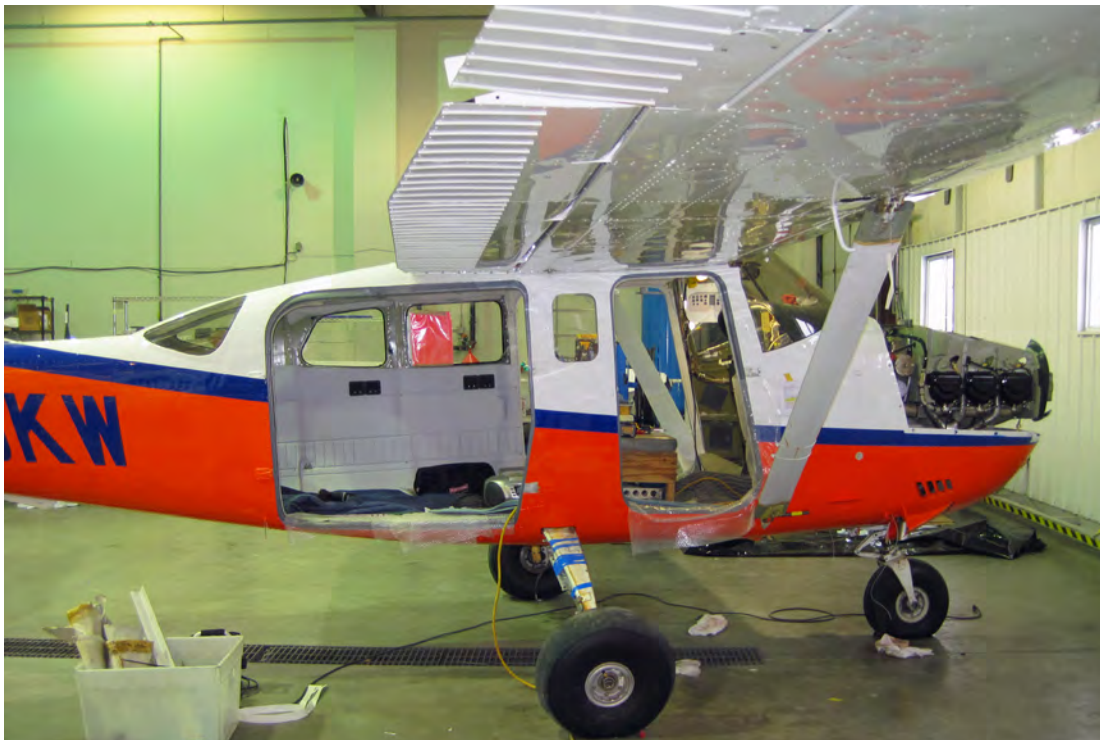
Wipaire's Co-Pilot Door STC Install