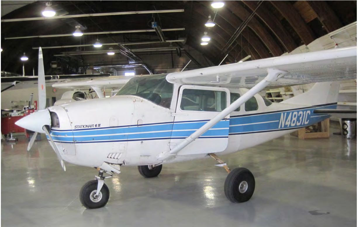
Equipped With Stock Continental IO-520 Engine