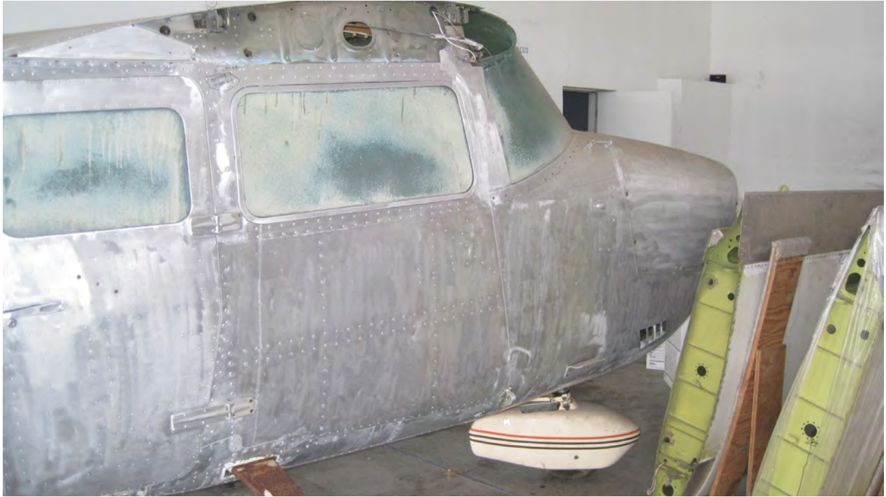
The Blank Canvas