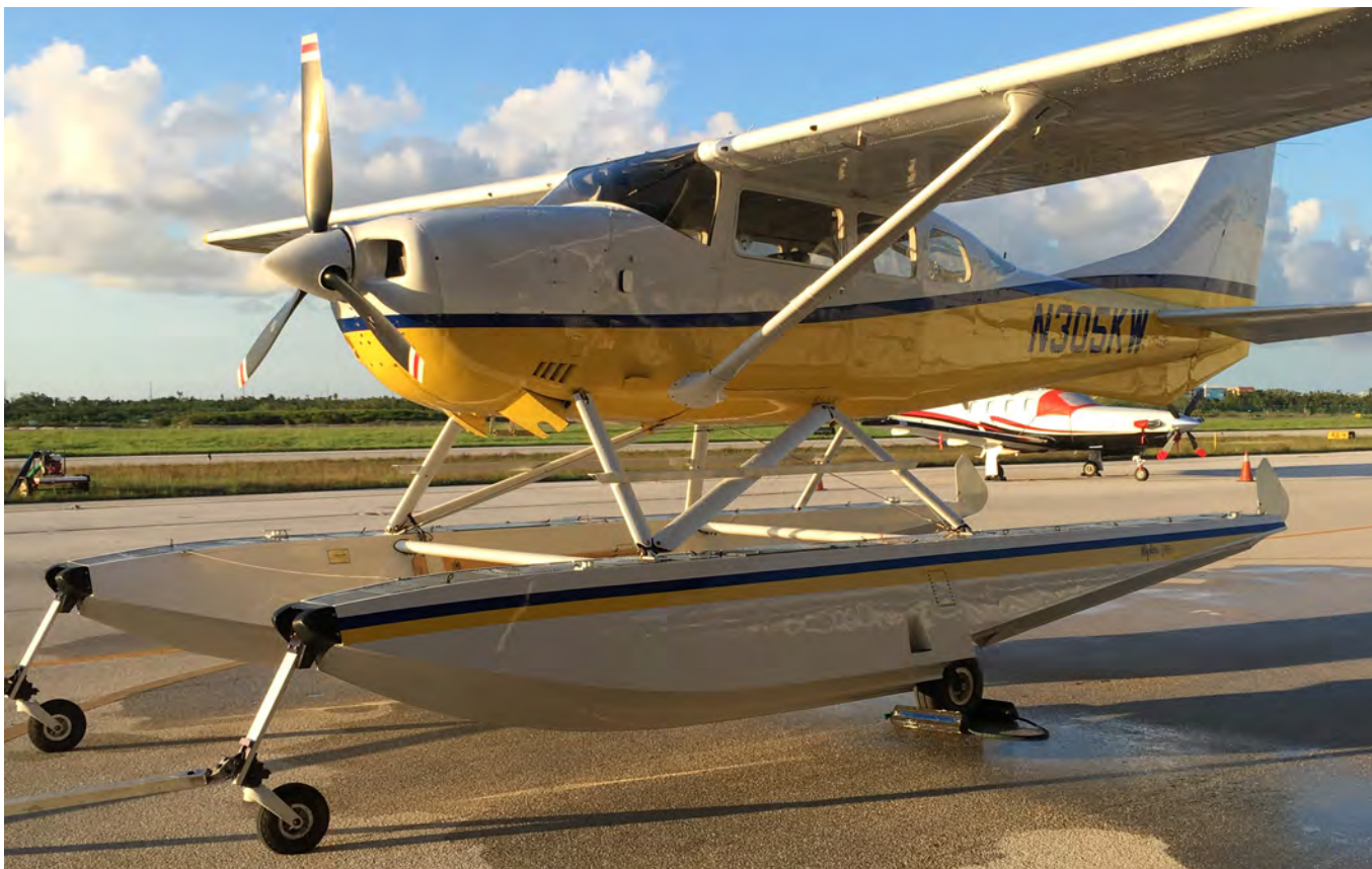
IO-550F Engine Upgrade and Wipline 3450 Floats