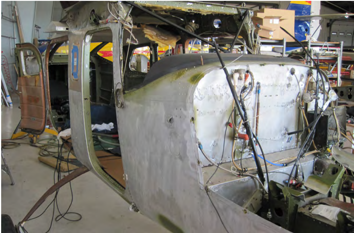
Wipaire Co-Pilot Door and "Wip" Tips Installed

Complete refurbishment by Wipaire. Customized build for high useful load, and a modernized cabin and panel. All upgrades done with weight in mind for the highest ultimate useful load. No expense spared!