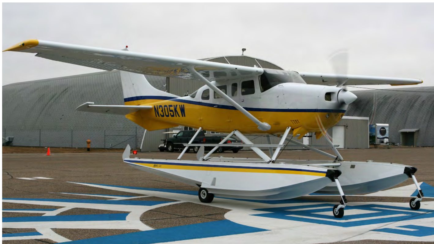
One of the Lightest, Highest Performing 206 Amphibs Available!