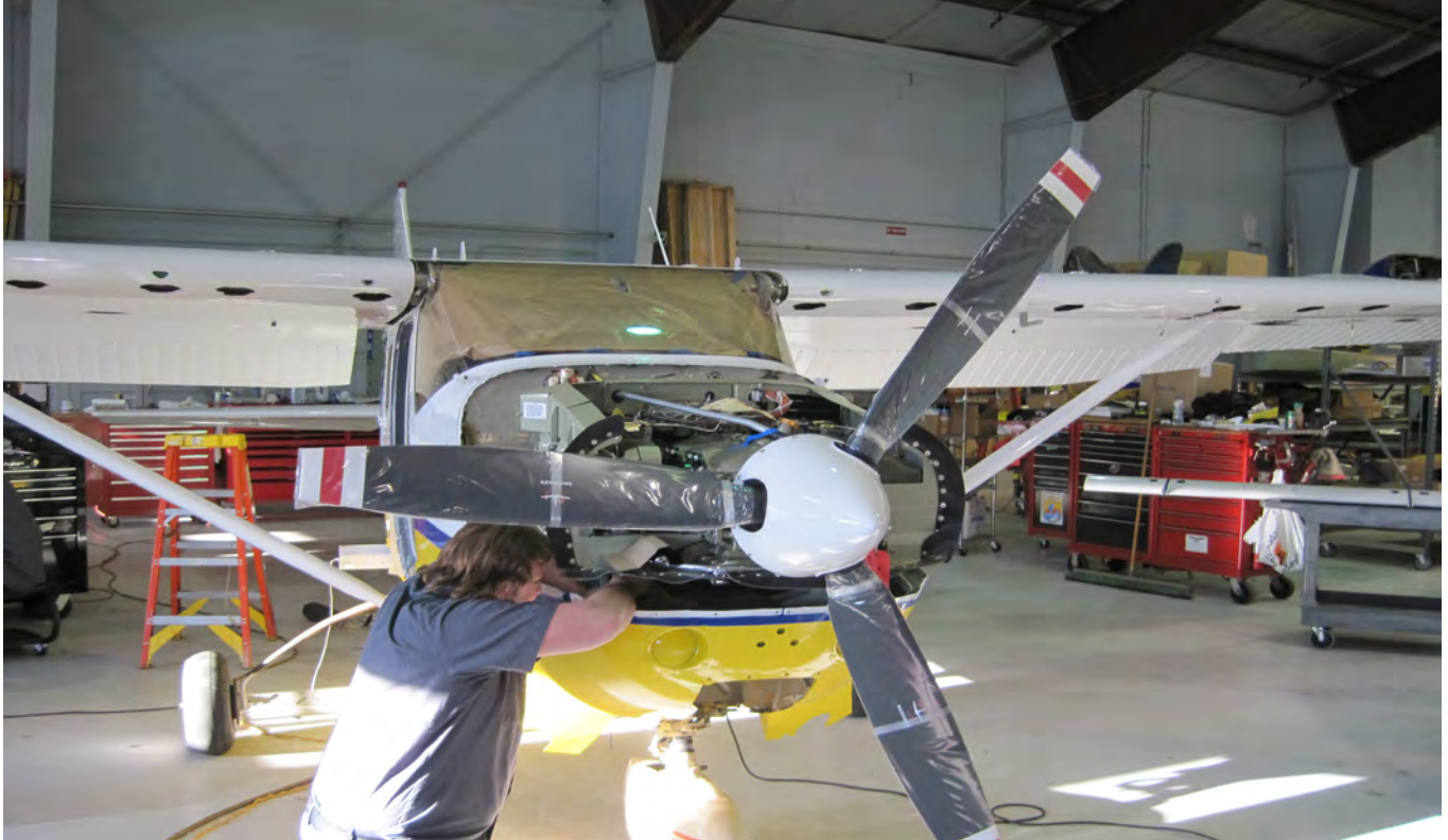
3-Blade McCauley With Extra Stripe for Safety.