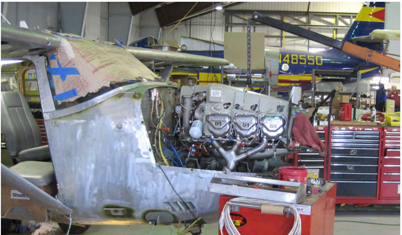
300 HP Continuous 550 With No Time Limit!