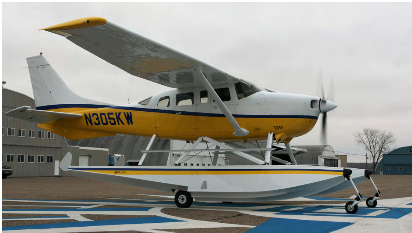
Custom PPG paint by Wipaire 2012. One of a kind, White/Yellow/Blue. New glass throughout.