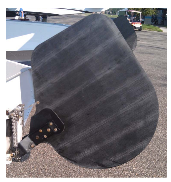
Figure 6. Original 7000 float water rudder.