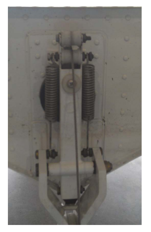
Figure 5. New spring attachment locations.