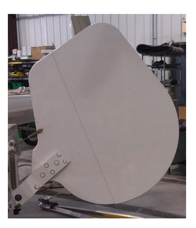
Figure 7. 8000/8750 style water rudder (shown painted, part comes bare).