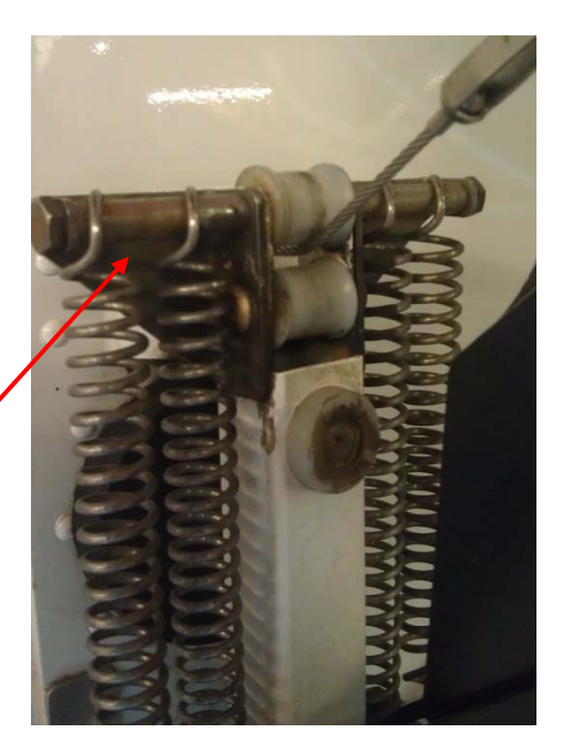
Figure 1. 7000 water rudder springs showing upper bracket.

Figure 2. 7000 water rudder springs lower bolt attachment.