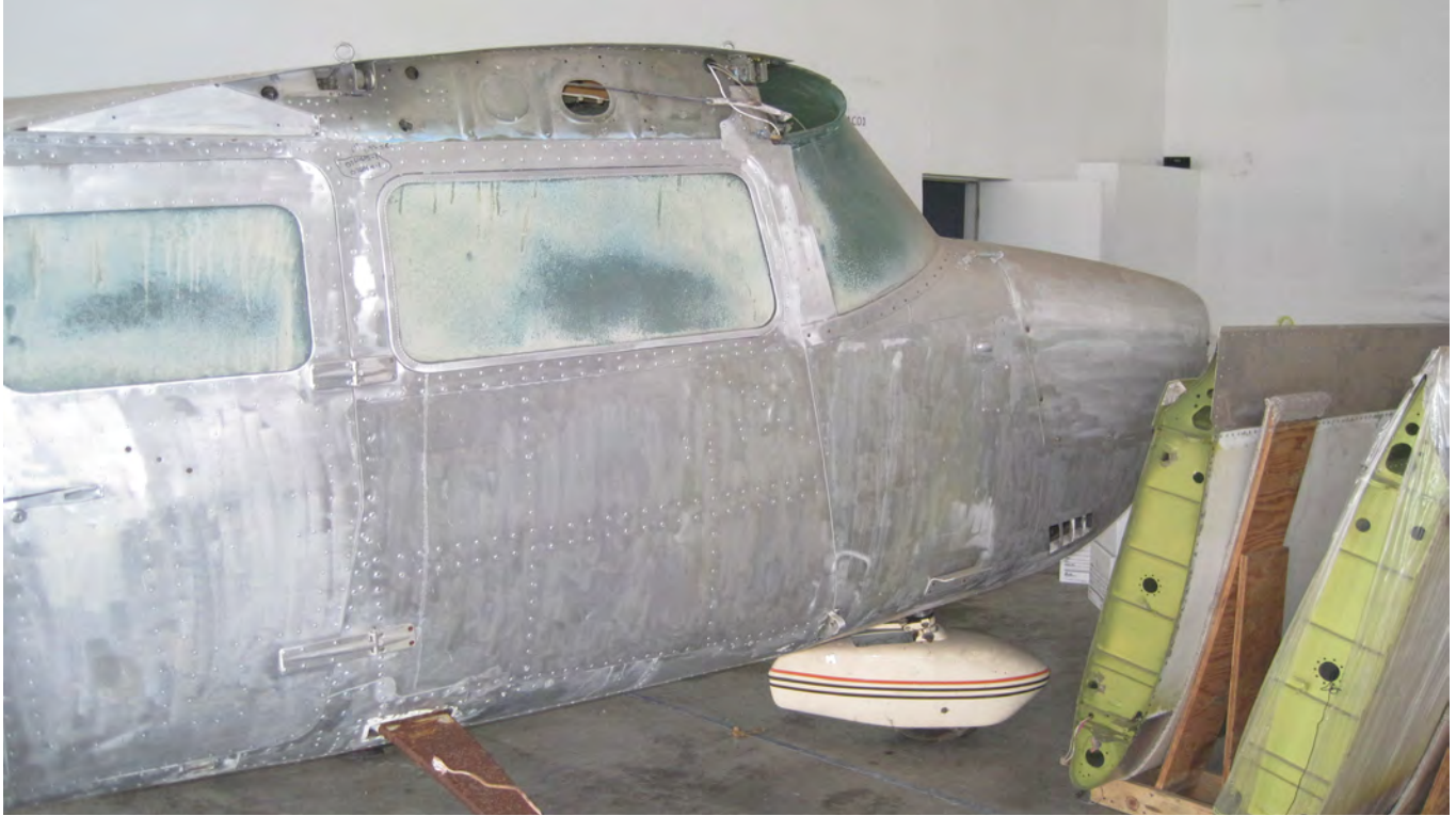
The Blank Canvas