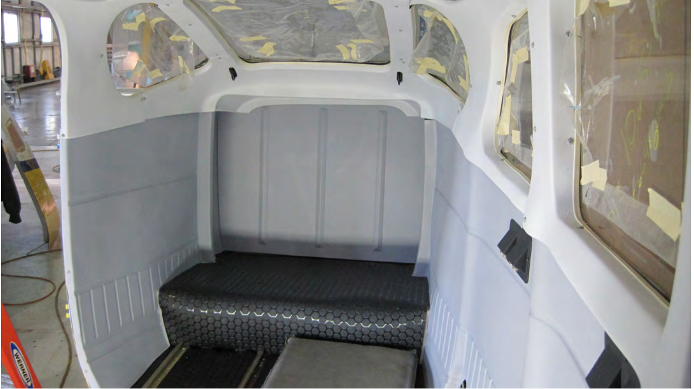
New Interior and Propeller are Installed