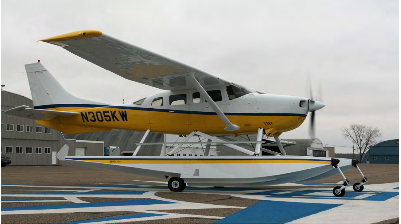
IO-550F Engine Upgrade and Wipline 3450 Floats