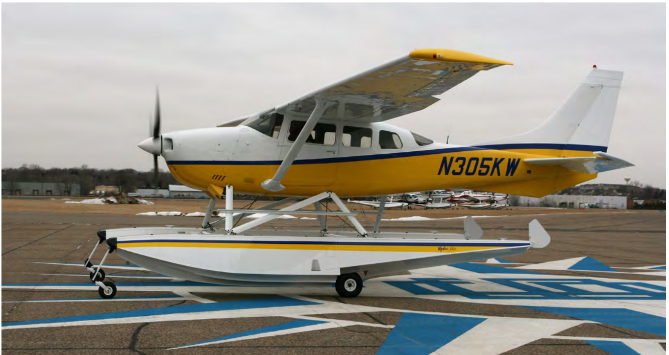
One of a kind, White/Yellow/Blue