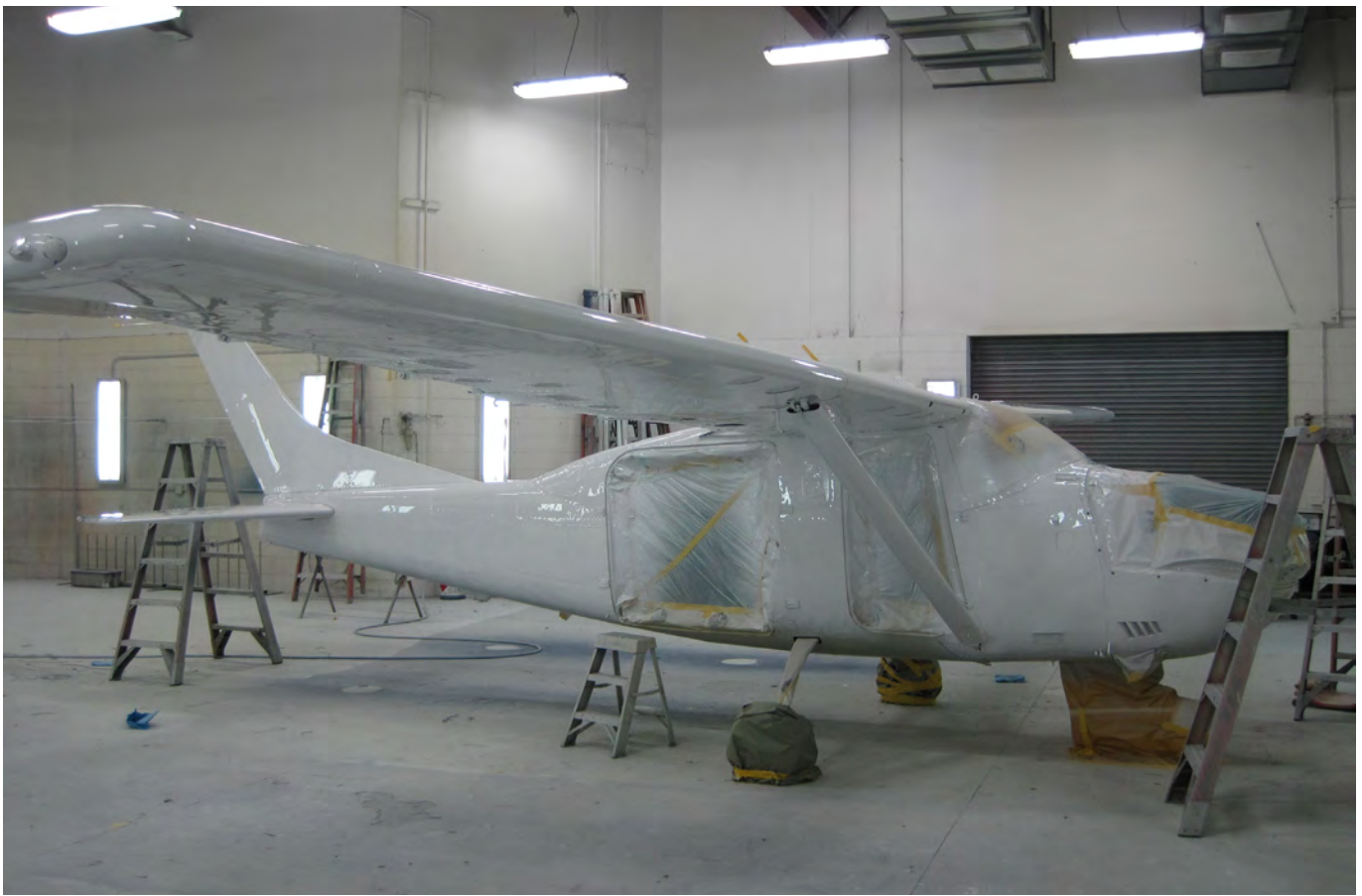
Paint Base Coat and Striping Being Completed