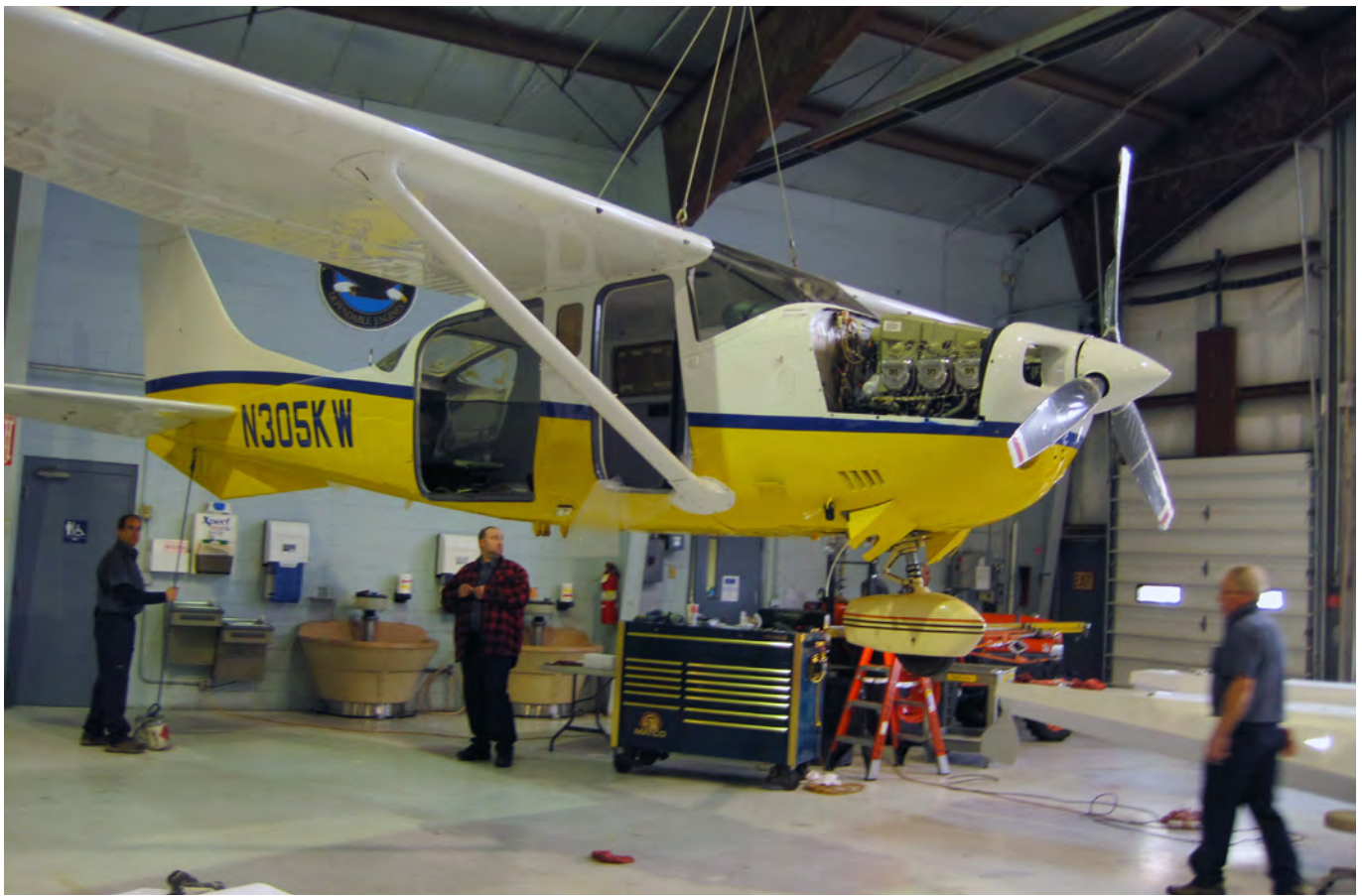
New Wipline 3450 Floats are Installed