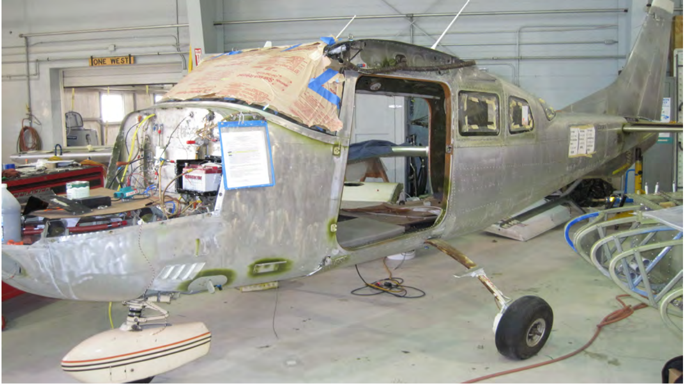
New Glass and the IO-550 Engine Installed