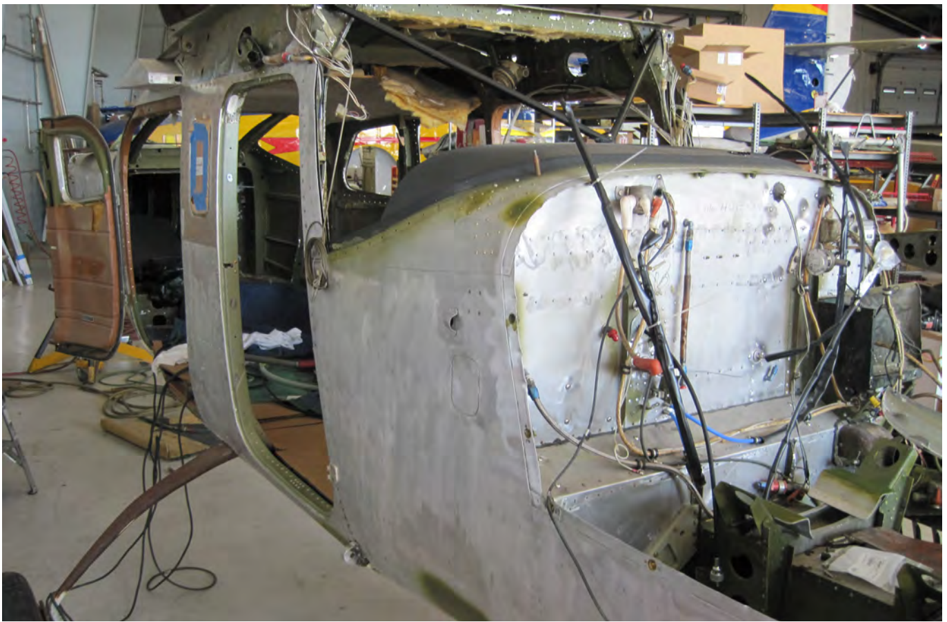
Wipaire Co-Pilot Door and "Wip" Tips Installed