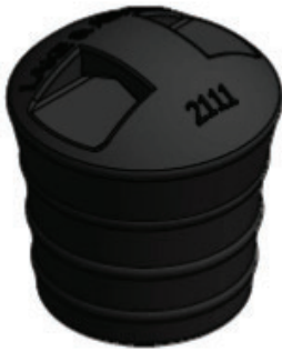
Current Pump Out Plug

* Items 2 and 3 are included in 1011075 Assembly, Pumpout Plug, Duckbill.